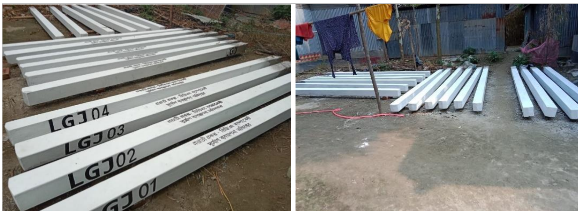
(b) Field Visit for Land Gauge Supervision