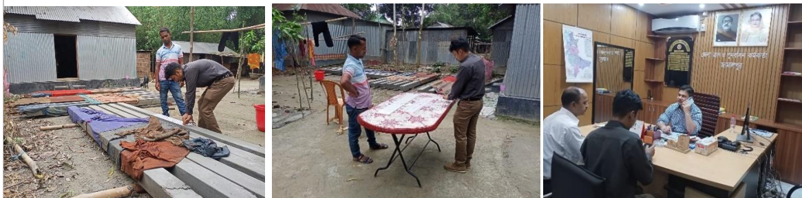
Activity 4. Flood Shelter Data Review and Mapping

A field visit was conducted in Jamalpur, Gaibandha and Kurigram district to inspect the quality of construction work of the land gauge installation. During this visit, the build quality and work progress of the land gauges has been observed. The vendors were advised with recommendations from DDM and RIMES. It was also observed if all the requirements from PIU are being served. Currently the paint job and scale drawing in progress on the finished land gauge. For scale drawing a mold was taken from Dhaka office to the construction sites of the three districts. The local administration was informed about the ongoing activities and progress of the project.